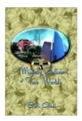
Figure 1: A Mighty Collision of Two Worlds