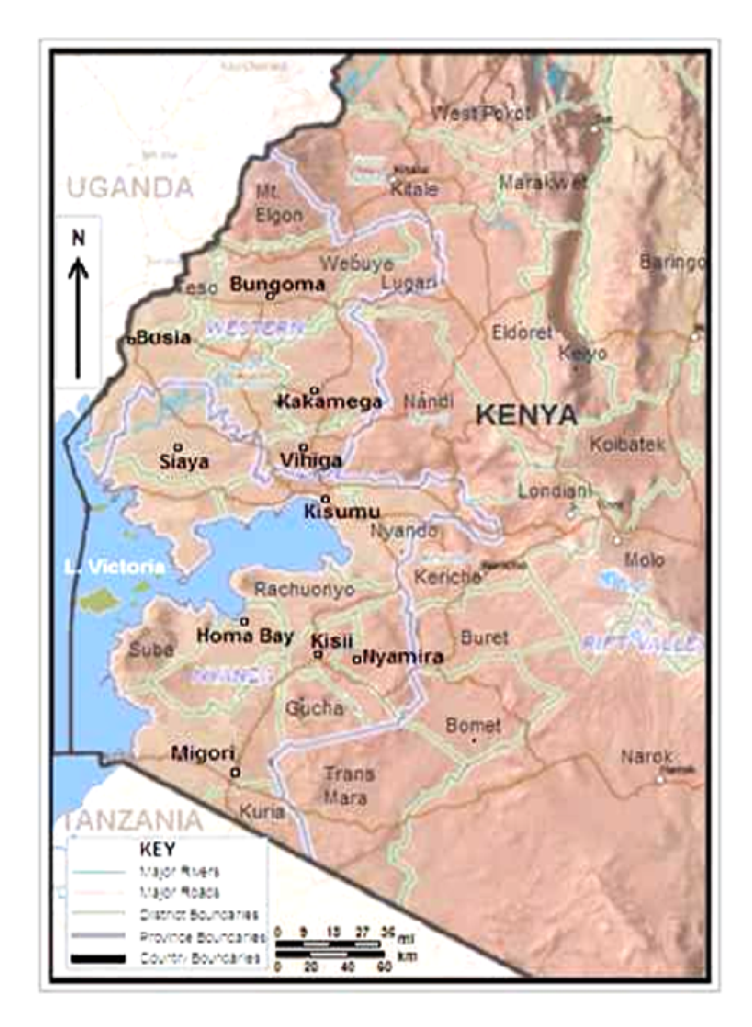
Figure 2. Map of Western tourism circuit, Kenya

expectations. Gap two is the difference between manager's perceptions of service quality and service quality specifications. Gap three is the difference between service quality specifications and actual service delivery. Gap four is the difference between service delivery and what is communicated externally. Gap five is the difference between what customers