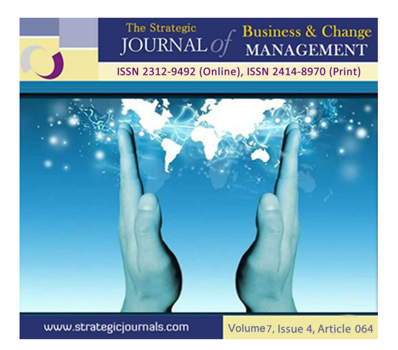
EFFECT OF TRANSACTIONAL LEADERSHIP STYLE ON EMPLOYEE ENGAGEMENT