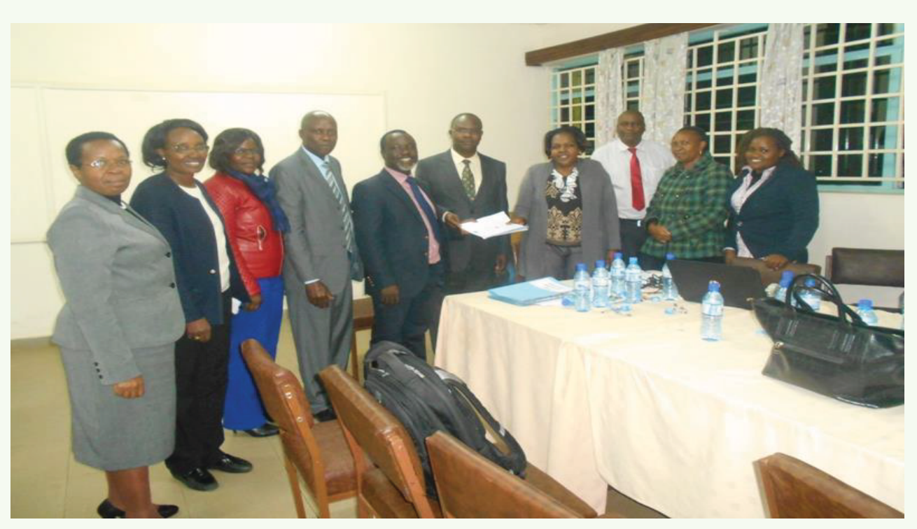
Murang'a University of Technology Top Management, Council Members, Performance Contract Co ordination Team and Ministry Vetting Office, after a successful vetting of PC, FY 2018 / 2019 at Kenya School of Government, Embu Campus

On behalf of the Directorate of Performance Contract and ISO, I take this opportunity to congratulate all those graduating on this occasion. May the favor of the almighty guide every step you make in the actualization of your other aspirations