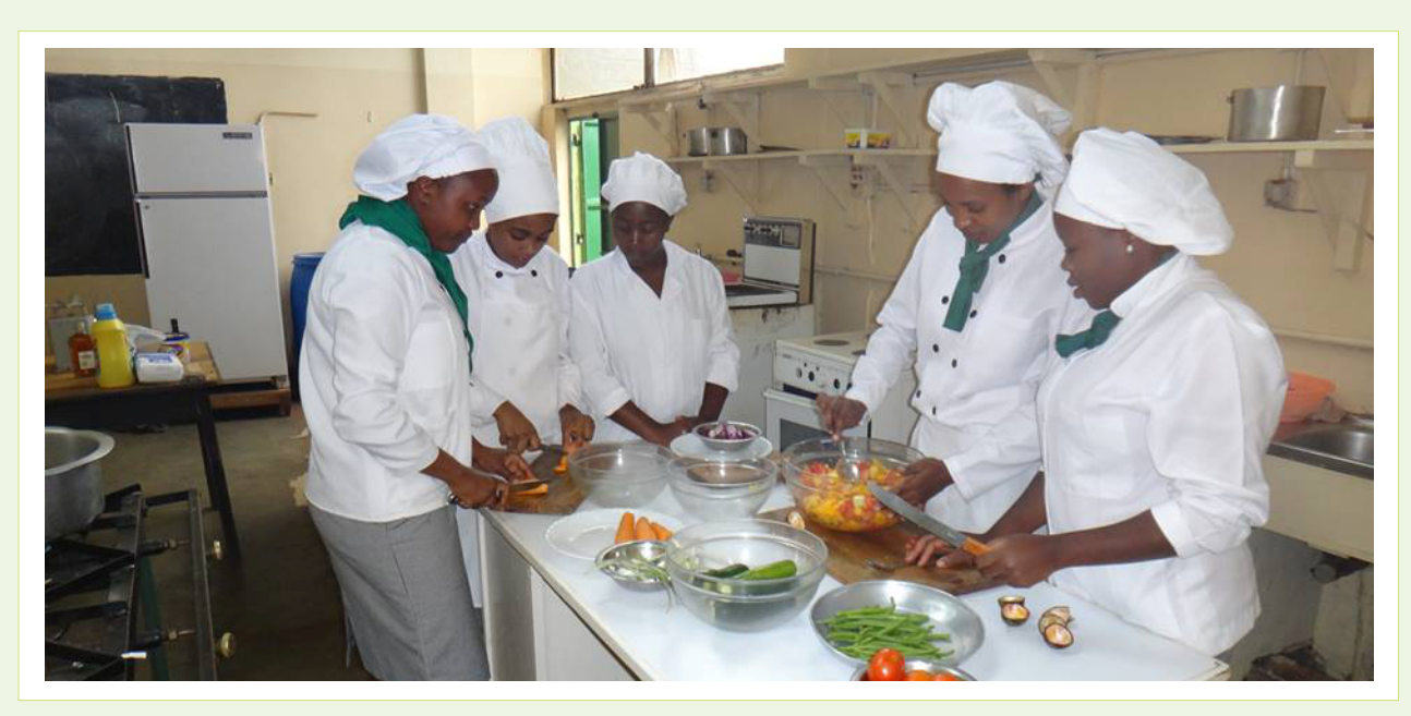
Hospitality students' food production practical training

Félicitations pour l'obtention du diplôme!