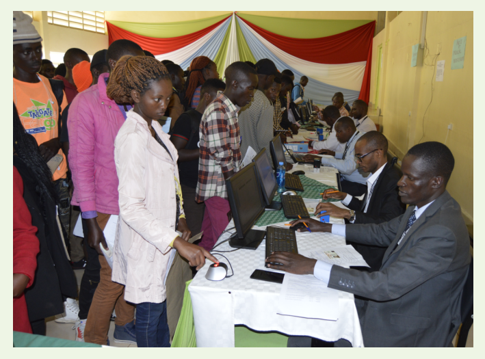
Registration of new students at the Assembly Hall