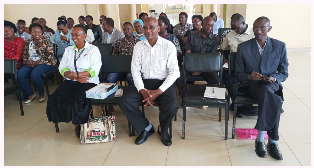
Community members follow keenly during an entrepreneurship training session organized by LOP

We sincerely honour you for your invaluable contribution to the Directorate in building up Murang'a University of Technology and look forward to more collaboration in future. We also invite other universities, business partners, research institutions and well wishers to partner with us.