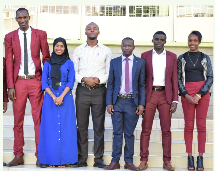
The new MUTSO Council Officials