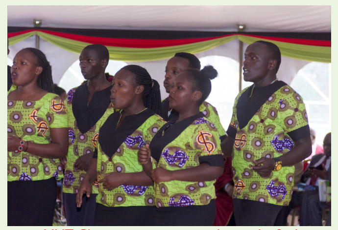
MUT Choir entertains guest during the 2nd graduation Ceremony