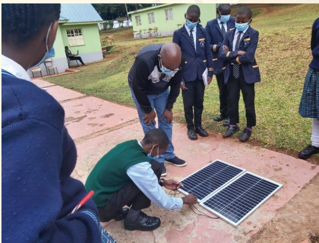
Green Energy during MUT pre-college course