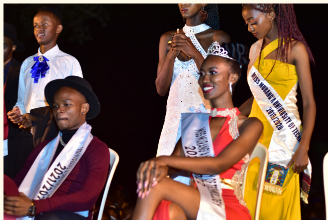
Students participating in the MUT beauty contest