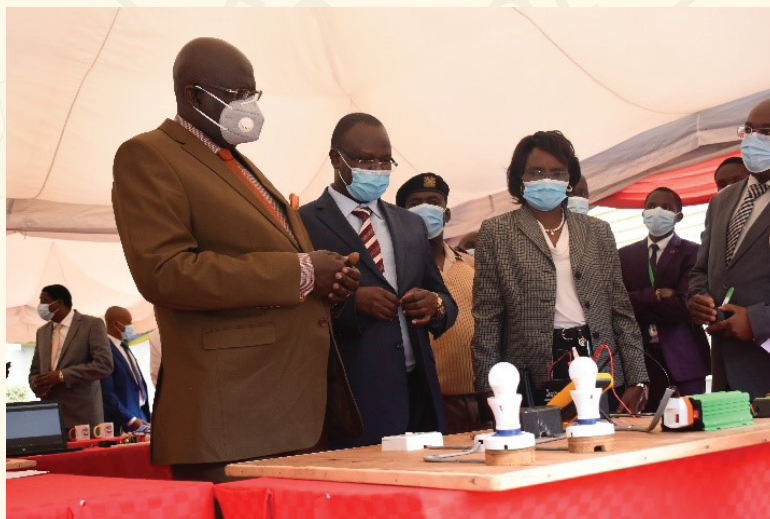
MUT showcasing various innovations in the exhibitions sessions during the MUT international conference to Education CS, Prof. Goerge Magoha.