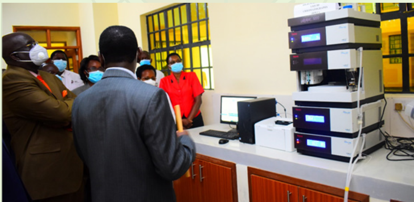
SPAHS showcasing the modern lab machines to the CS Education, Prof. George Magoha, during the MUT conference and exhibition