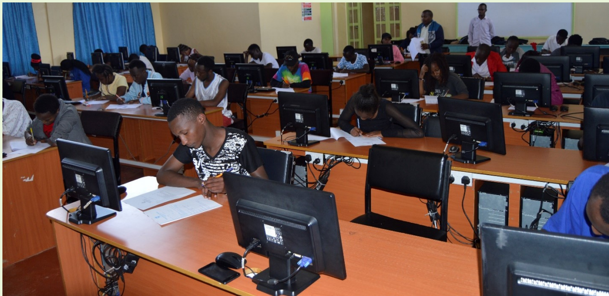
Students doing exam in the Computer Laboratory in the School of Computing and IT