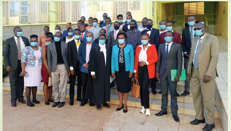
2021 MUTSO inauguration ceremony