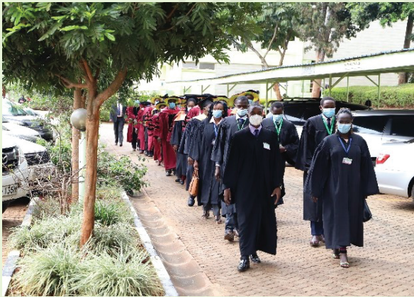
Procession of the Matriculation ceremony and welcoming of first years' orientation