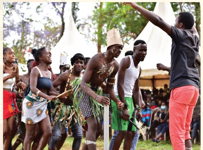
Students participating in the 2021 cultural week events