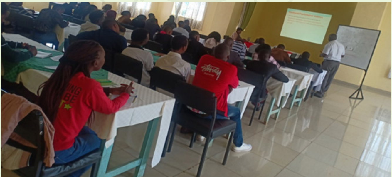
Training of Gender Ambassadors done by family options- Kenya. The gender ambassadors are responsible for disseminating the gender policy, sensitizing other students on gender based violence and sexual harassment.

Finally, warmest congratulation to all our graduating class on their well-deserved success.