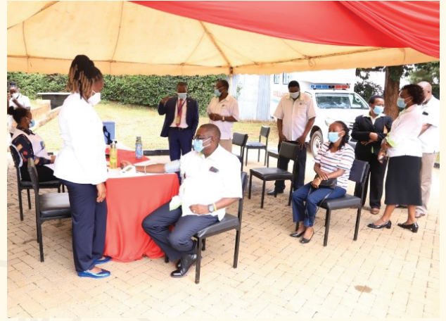
Part of the University Management leading the other staffs in the Covid-19 Vaccination process in the University Health Unit.