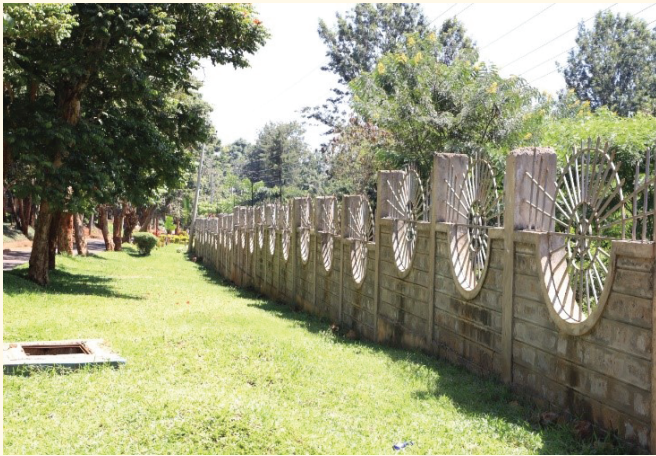
The University Perimeter wall is underway