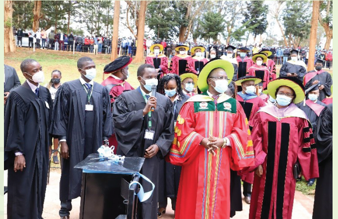
MUTSO launching of Projected Screens and Frustration Benches