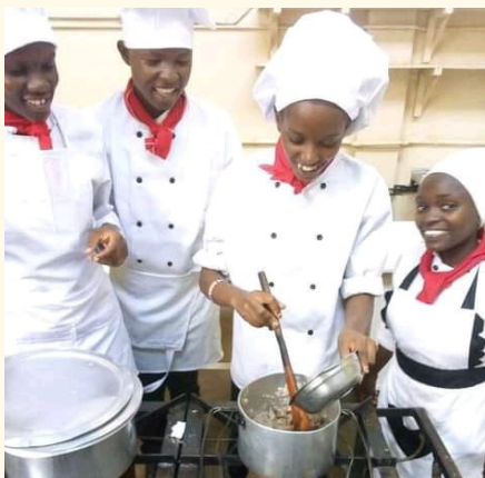
School of Hospitality and Tourism Management students in the kitchen

Congratulations once again to each one of you!