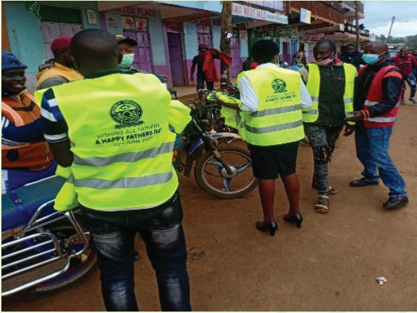
Distribution of reflector jackets to bodaboda operators in Murang'a and Kirinyaga Counties as a way of celebrating the international father's day and spreading the message on gender equality.