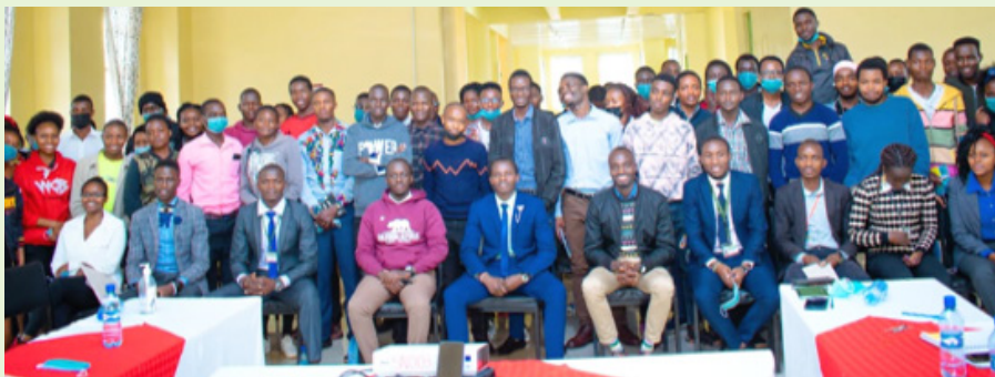
MUTSO Class Representatives Summit May-August 2021 Semester.