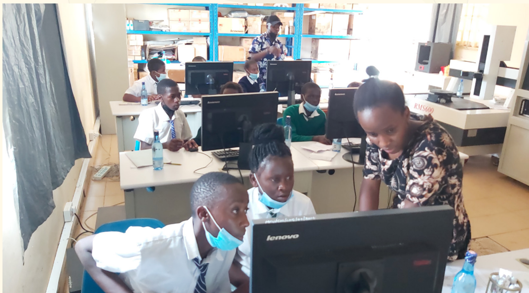
SET Introducing the High School Students to Computer Aided design

The School aspires to mount other Engineering Science programmes including but not limited to Bachelor of Science in Mechatronics Engineering and Bachelor of Science in Civil Engineering amongst others.