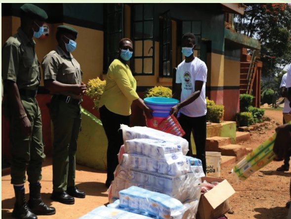
MUT donating basic amenities to the Murang'a Prisons as part of CSR