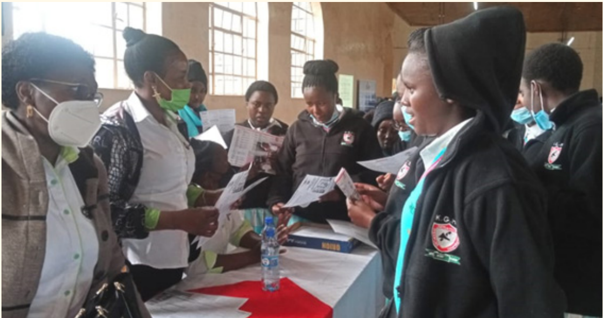
Murang'a University conducting career choices during Karima girls high school 8th annual Career Fair Day