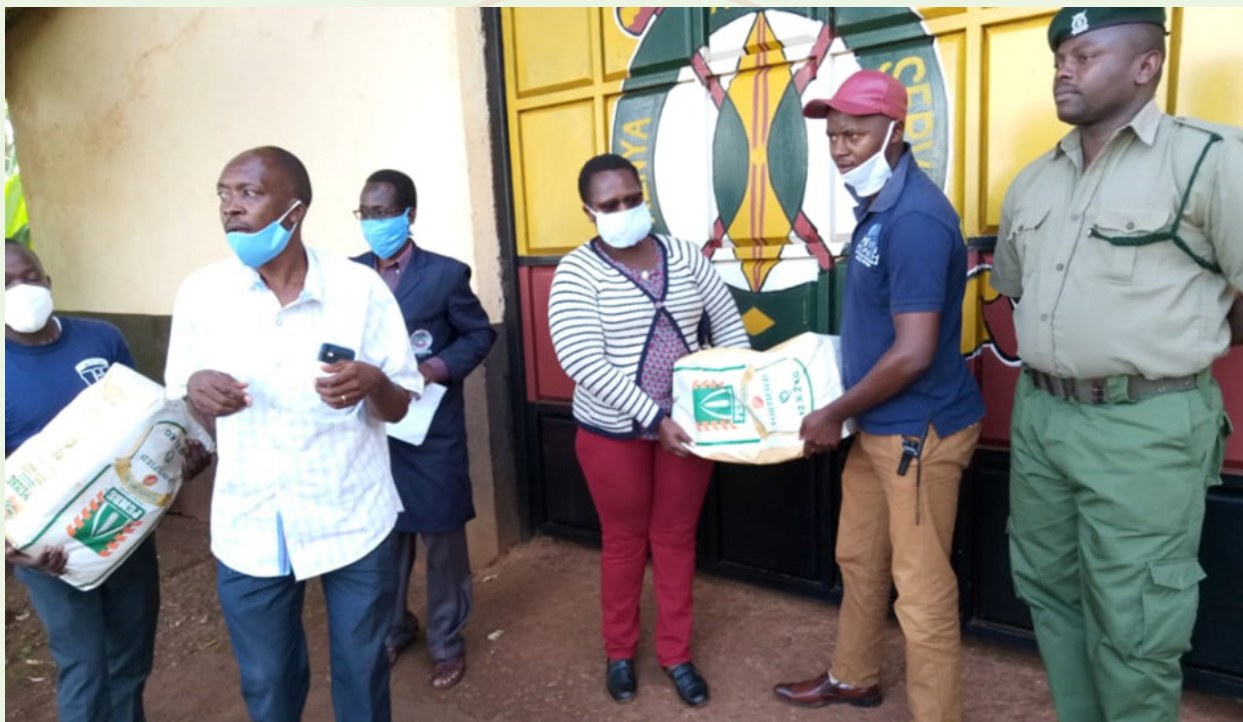
MUT STAFF GIVE FOOD DONATIONS TO MURANG'A PRISION IN RESPONSE TO COVID-19

We conclude with this proverb: - 'Commit your ways to the Lord and he will direct your paths.' The LOP Directorate under the guidance of MUT leadership continues in these unique times to initiate and grow linkages, collaborations, partnerships and outreach services to serve the University, the Community and the nation of Kenya, locally and internationally. God bless you.