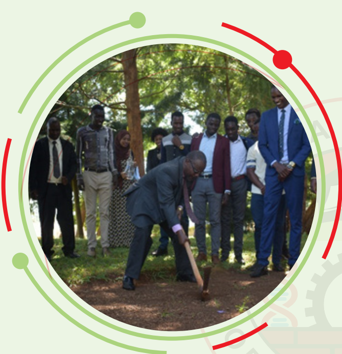
The Vice Chancellor leading the ground breaking exercise for a modern basket pitch along side other members of the University Senate and the student council