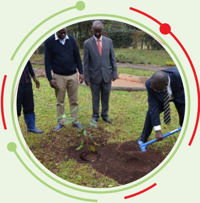
The Vice Chancellor, leading the Tree Planting Session to Commemorate the Alumni Association Launch