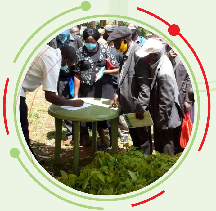
MUT Staff at Mariira farm giving out Hass Avocado seedlings