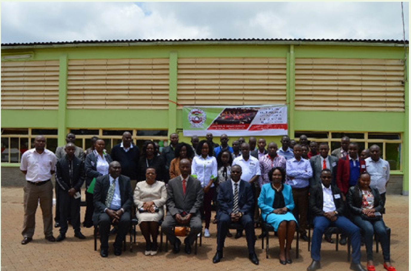
The Vice Chancellor and other members of the University Management Board joining the group photo with other Alumni after the Launching of Alumni Association

Graduands remember the certificate you've acquired today marks the beginning of another opportunity. I encourage you to pursue higher levels preferably in our university. We say the sky is no longer the limit, but a stepping stone to universe.