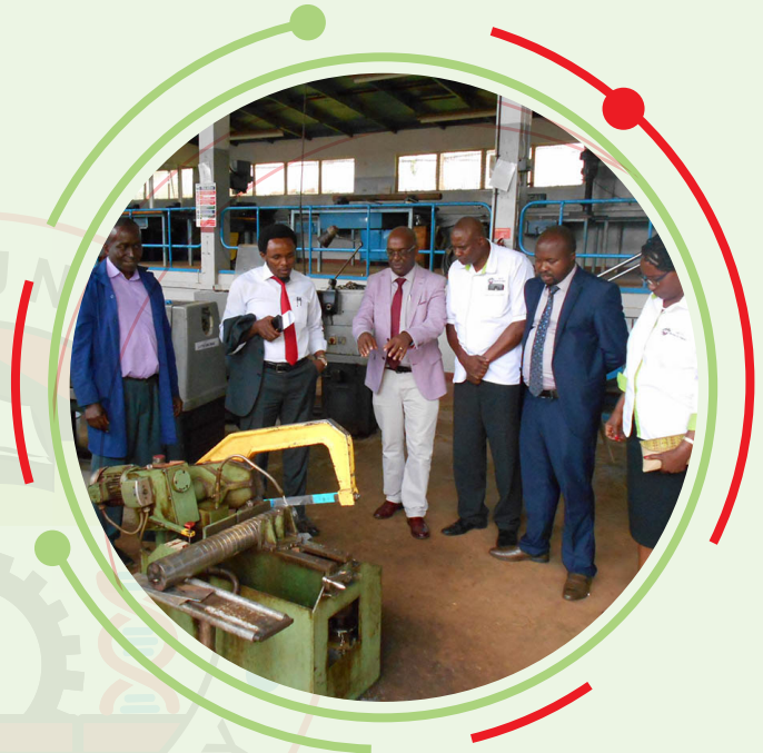
CAS Ministry of Education, Hon. Zack Kinuthia Touring Engineering Department