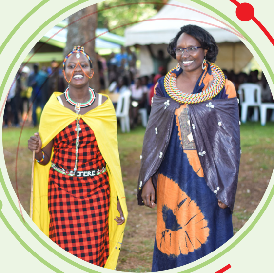
DVC ASA, participating in the cultural events