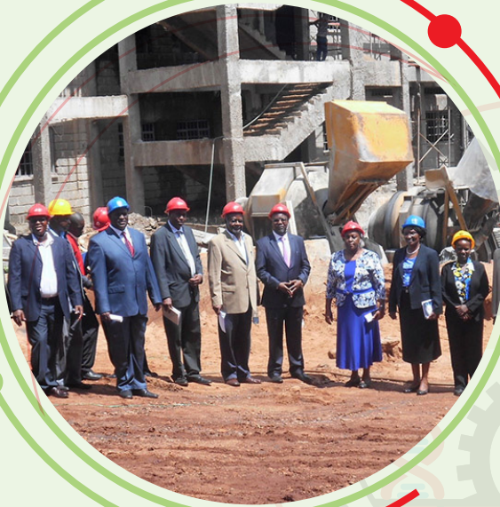
Site inspection for the ongoing science complex