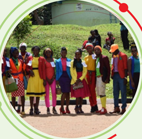
Students participating in color clashing session during the cultural day event