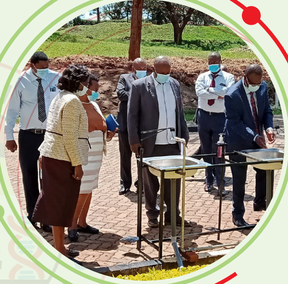
Inspection for re-opening by a team from Ministry of Education