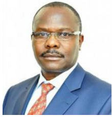
Ag. Vice - Chancellor