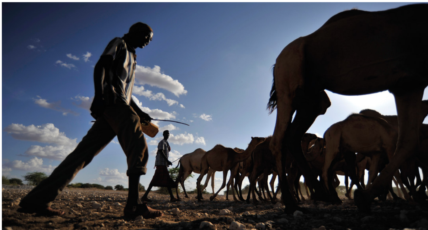
Weather-based insurance in Kenya covers pastoralists for livestock losses in drought conditions, resulting in fewer distress sales of animals and less reliance on food aid.

Insurance may be an important mechanism for farmers to break the cycle of low input, low output farming. The challenge now is to scale up the many pilot schemes and make insurance easily available to the smallest smallholder farmers. ■