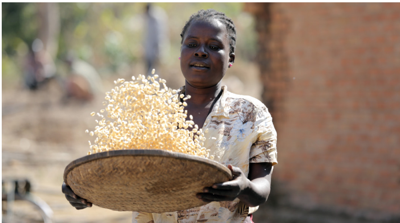
Female Soya Farmer at the Anchor Farm Project. A female farmer cleans soya in Malawi at the Clinton Development Initiative (CDI) Anchor Farm Project. The Anchor Farm Project operates five commercial farms in the Kasungu and Mchinji districts of Malawi and partners with 21,000 neighboring smallholder farmers, providing them with access to quality inputs for maize and soy production as well as training and market access.

Women in particular have benefited from growing soybean, because it is a fast growing legume that fetches good market prices compared to other legumes such as common beans, peas and pigeon peas. Women also use soybeans to feed their families, which in itself has increased demand for the crop. The income farmers earn from selling soybean is used to pay for school fees and medical expenses, farm inputs and home improvements. Some have invested in non-farm businesses such as grocery stores, and project communities are undergoing an economic revolution. ■