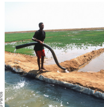
Irrigation channel and salicornia field at Seawater Farms Eritrea, the world's first commercial-scale integrated seawater farm.

Better information at all levels is helping to improve the management of water resources available to smallholders. And with the effects of climate change being felt, the National Agriculture Project is making water management a priority. ■