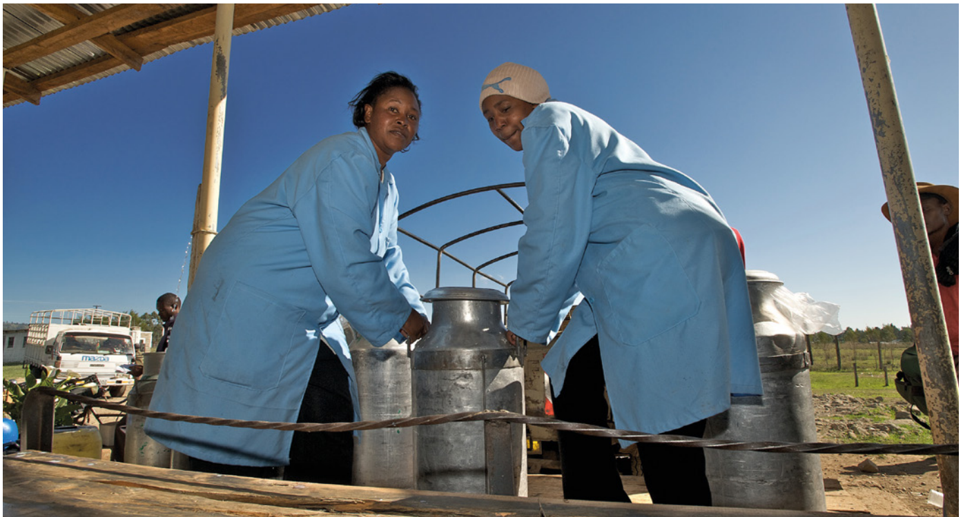
Milk delivered to the chilling plants established through the project can be sold into formal dairy markets and offers better quality milk for traditional markets.

The project also supports the development of agricultural practices that mitigate climate change. Better livestock feeding and manure management have potential to reduce greenhouse gas emissions and increase farmers' incomes. The project is therefore experimenting with techniques like fodder banks, improved pasture species, feed legumes and the use of crop by-products for livestock feed to achieve these twin climate change mitigation and improved livelihood goals. ■