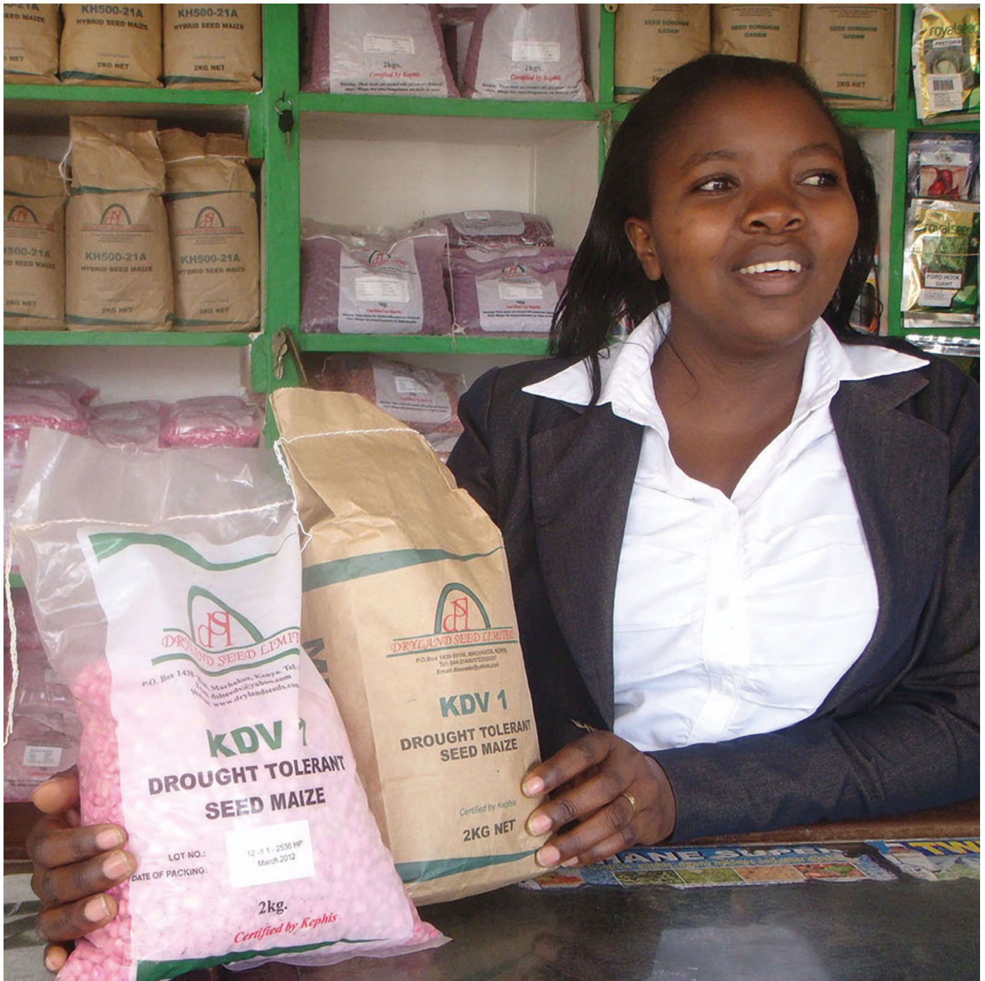
An attendant displays KDV1 drought-tolerant seed at the Dryland Seed Company shop in Machakos, Kenya.