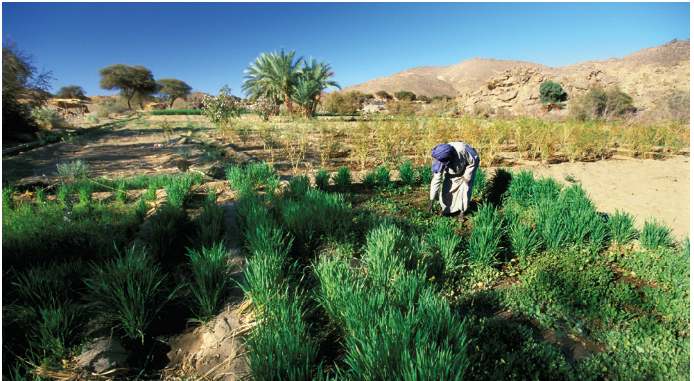
Algeria Tamanrasset man of Tuareg tribe harvesting beans.

At a multitude of levels, and through interventions of many different types, this programme seeks to help farmers move towards more resilient, drought-resistant and climate-smart agricultural practices. ■