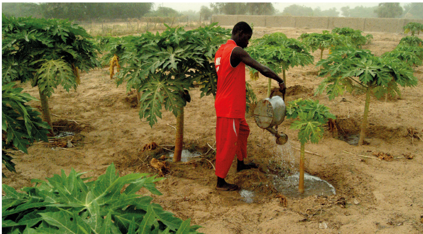
A farmer waters papaya trees in Mali.