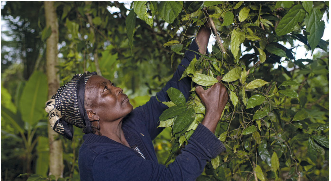
A woman harvests all the leaves from Gnetum spp. (okok) in the village of Minwoho, Lekié, Center Region, Cameroon.