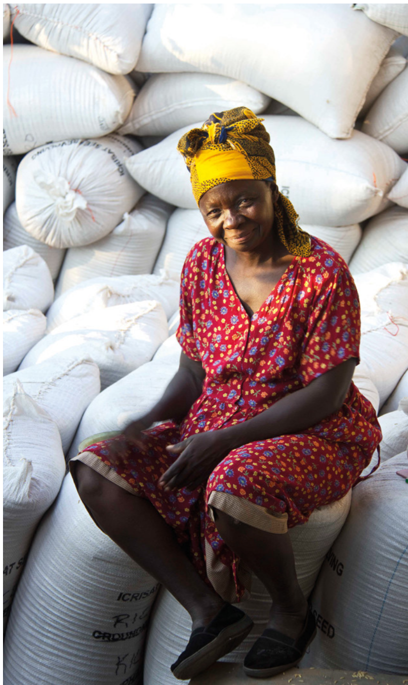
Trade in high quality, affordable seed is facilitated by alignment of national seed policies among countries in the SADC.

Because the aim of the project is to alter national policy, it is essential to engage with high-level government officials throughout the process and to bring in legal officers from the relevant ministries right from the start