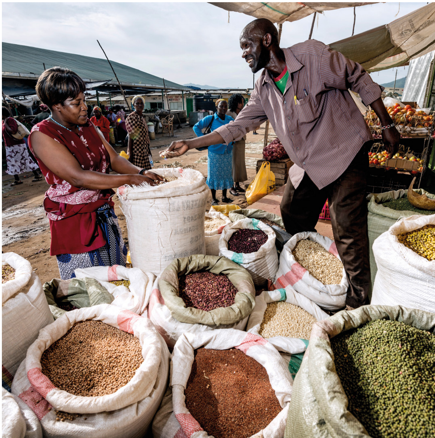
People selling seeds and beans in a market in the town of Wote, Kenya.