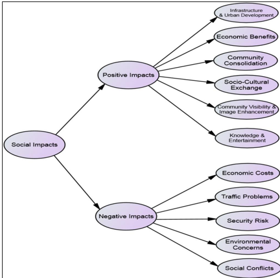
Fig. 1: Proposed model of the scale of perceived social impacts